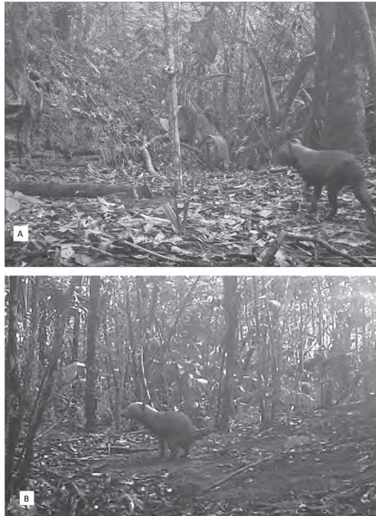
Figure 2. Camera-trap photograph of Bush dogs Speothos venaticus in A) Serranía de la Lindosa (Guaviare department) and B) Llanos Orientales (Meta department).

camera-traps are providing important contributions to the knowledge of the distribution of the species throughout its range (Michalski 2010, Fusco-Costa & Ingberman 2012, Meyer et al. 2015). Due to the