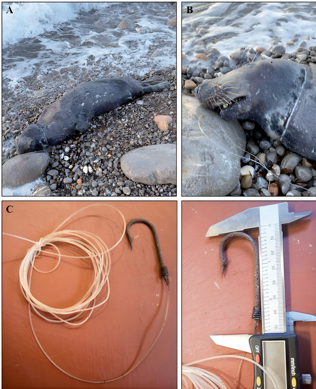
Figure 2. (A) Adult female grey seal found dead stranded in Cala Jondal (Eivissa Island) on December 24th 2020. (B) Head detail, the grey seal had a longline sticking out of his mouth and showed a visible constriction around his neck. (C) Fish-hook nailed in the stomach.

In accordance with the nearest natural habitats of H. grypus to the Mediterranean Sea, the individual recorded in December 2020, is probably of atlantic origin and could have come from the population that exists on the French coasts (in the Molène and Sept Îles), which were sustained by immigration of juvenile seals from Great Britain (Prieur & Duguy 1981), or from the Great Britain colonies. It enters the Mediterranean Sea through the Strait of Gibraltar. Interestingly, Vincent et al. (2005)